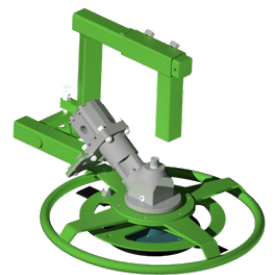
COUPALEX (hydraulics) Inter-row mower