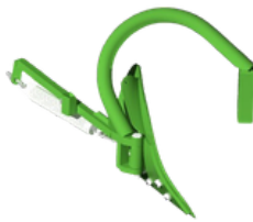
DECALEX (mechanical) Inter-vine cultivator