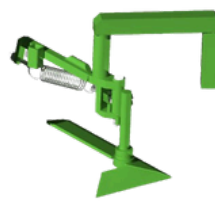
BINALEX (mechanical) Hoe blade