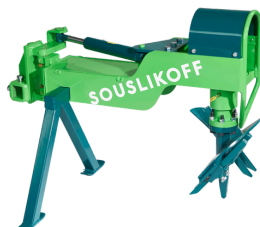
FORALEX LIGHT TAKE 03