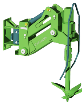
FORALEX FLEXI TAKE 06