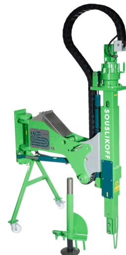
FORALEX SUPER TAKE 05